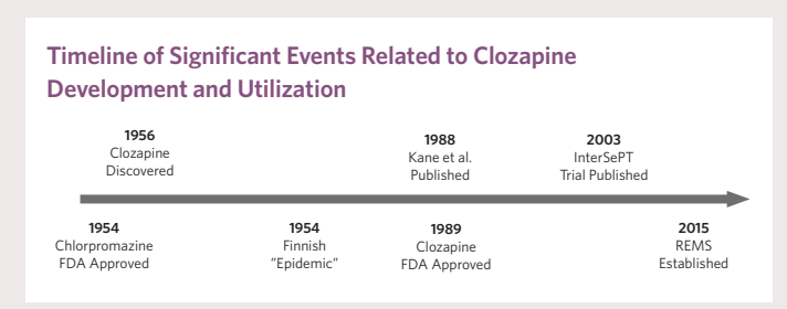
Figure 2. Timeline of significant events related to the history of clozapine.

Though early evidence demonstrated clozapine's superior efficacy over chlorpromazine in patients with refractory psychotic symptoms, no trials to date had definitively captured this phenomenon. In 1984, a multicenter, randomized controlled trial commenced (including patients at Mayview State Hospital in Pittsburgh), sponsored by Sandoz. In 1988, results of this work were published in Kane et al., widely considered to be the landmark and pivotal clozapine trial supporting its benefit in treating refractory psychotic symptoms.<sup>3</sup> In this study, patients underwent a prospective trial of high dose haloperidol (60 mg/day) to confirm their lack of response and then were randomized to clozapine or chlorpromazine. The results demonstrated that 30 percent of treatment-resistant schizophrenia subjects randomized to clozapine had significant improvement in positive and negative symptoms compared to 4 percent of subjects randomized to chlorpromazine. These efficacy findings were so dramatic that they led to the FDA fully approving clozapine under the trade name Clozaril in 1989 (Figure 2), with blood monitoring